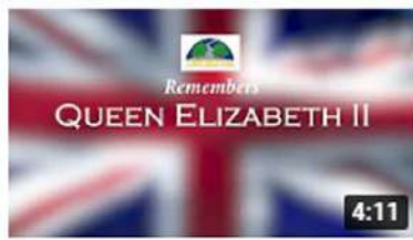
Two Mile Ash Remembers Queen Elizabeth II

There are a couple of new films on our Youtube Channel this term. Make sure you check them out!