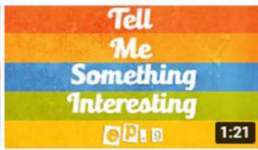
Tell Me Something Interesting - Ep 9